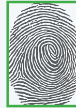
MSO 1300 Series Capture