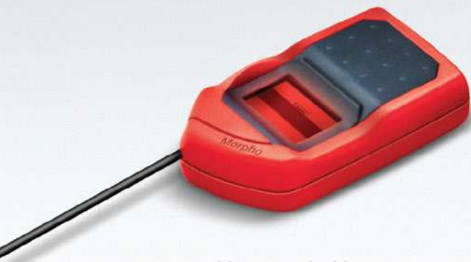
MSO 1300 V3 / MSO 1300 E3

The MorphoSmart™ 1300 Series offers a reliable, ergonomic and cost-effective solution for enrollment, identity verification and user identification. Their match-on-device or match-on-card functions guarantee the faultless protection of information and the security of desktop applications.