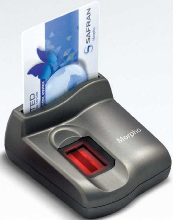
MSO 1350 V3 / MSO 1350 E3