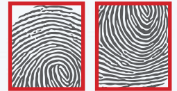
Placement variations on smaller sensors

MSO 1300 Series capture surface (14x22mm) ensures that the richest area on fingerprints is systematically captured time after time. Acquisition surface area contributes significantly to the overall biometric performance: